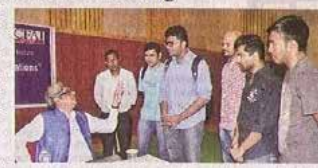
Prof. Bibek Debroy interacting with students at ICFAI University.