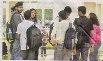
Icfai offers a stipend of about ₹25,000 as a fellowship and also inducts scholars as faculty after successful completion of their programme.

To promote research, the university is providing financial incentives of up to ₹1 lakh for faculty who publish their research papers in international and national, peer reviewed journals. "We also en-