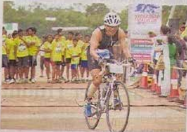
A participant at the 6th edition of the Triathlon in the city on Sunday.

The Triathlon involved swimming, cycling and running and a mini version of the event was also held for children aged five and above. The three-fourth iron, considered the toughest event, had professional athletes swimming 2.9 km and cycling 135 km and finally running 31 km.